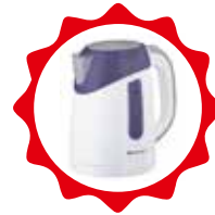
LED GLOWING LIGHT